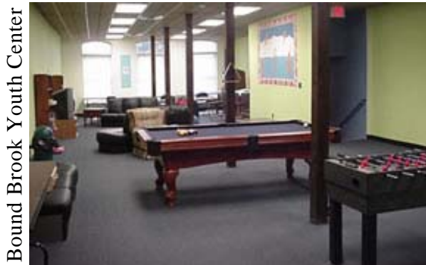
Bound Brook Youth Center